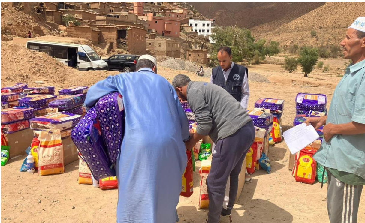
Food and NFI distribution, Ahl Tifnout,

IBC, with its extensive experience in implementing humanitarian and development programs, particularly in emergency response, has effectively coordinated its efforts with donors, partners, authorities, and local organisations. The collaborative approach enables IBC to efficiently address the urgent needs of the people in Ijoukak, Tinzart, and Taroudant . The organization has provided crucial emergency assistance, such as hot soup, hot meals, emergency supplies, and essential hygiene items. In recent days, IBC, with the generous support of partners like IDRF Canada, Action Medeor and Islamic Help UK , has been diligently working to distribute food kits, cooking ovens, tents, and blankets to hundreds of survivors affected by the earthquake.