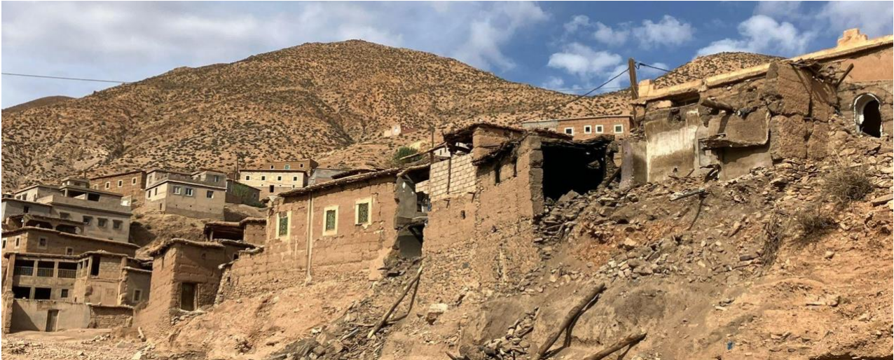
The village of Takaterte has been devastated by the recent earthquake.

Friday, 22 September 2023 Situation Report – updated 18:00 (GMT+3)