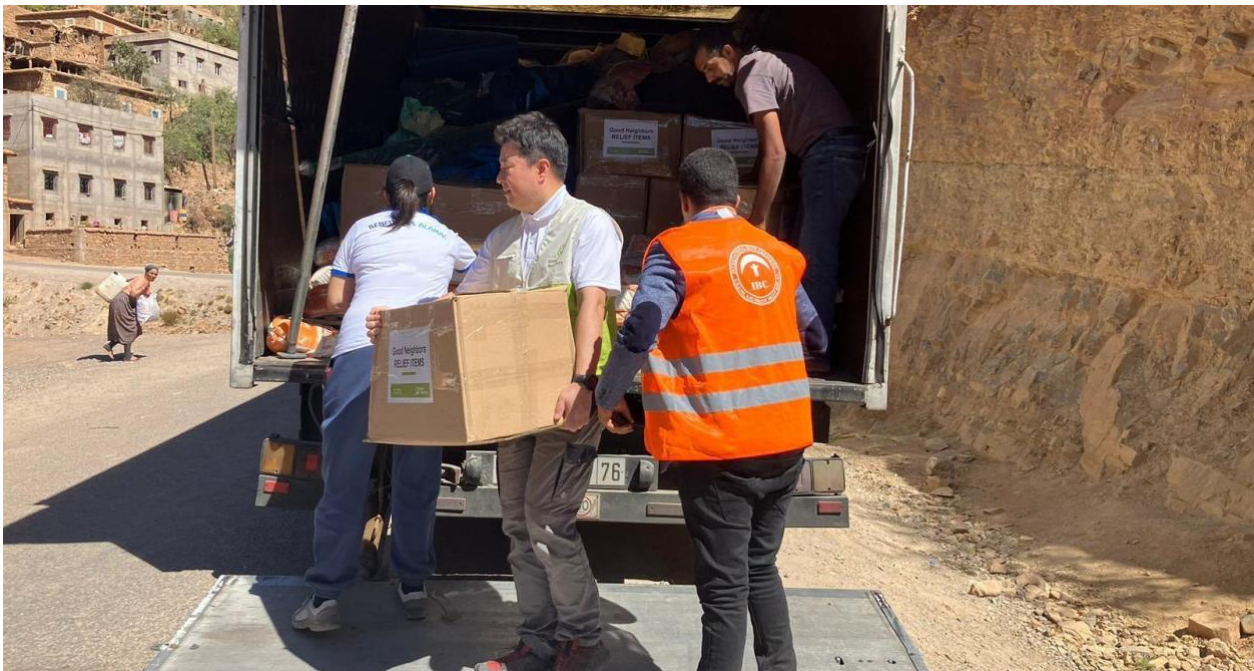
Food Parcels distributions, Takaterte / Ahl Tifnout

On 14 September, after 3 hours of driving and 2 hours of walking in the mountains, IBC and its donor IDRF were the first to reach a small village called Ijoukak, which was severely affected by the earthquake. IBC, with IDRF, was able to provide support to 150 individuals affected by the quake by distributing food packages, including sugar, rice, oil, tea, salt, flour, cookies for kids, etc.